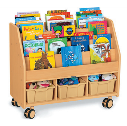
LK244 • Mobile Book Center 42"w x 18 ^3/_4 "d x 35 ^1/_2 "h. LM145 • Natural Color Big Bins - Set of 3