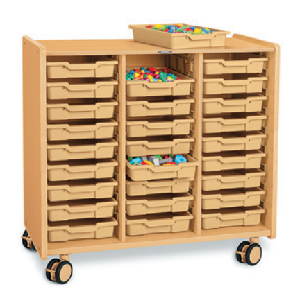
LK233 - Mobile Storage Tray Center 41^{5}/_{8} "w x 18^{3}/_{4} "d x 40^{1}/_{2} "h.