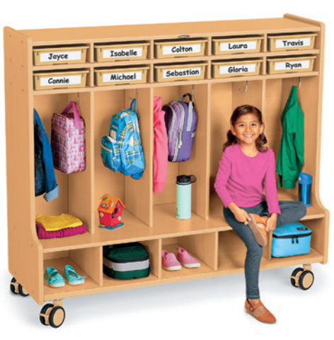
LK225 • Mobile Coat Lockers for 10 59^{3}/_{4} "w x 20^{1}/_{8} "d x 52^{1}/_{4} "h.

LK108 = Mobile Classroom Nook 47^{3}/_{8} " w x 26^{1}/_{4} " d x 47^{7}/_{8} " h.